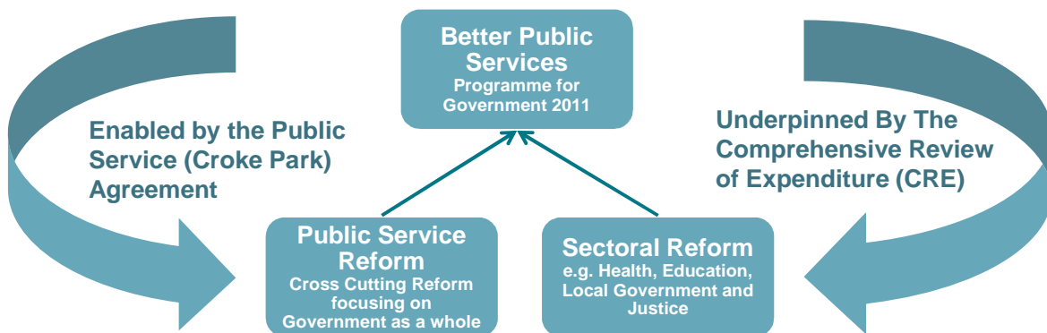
Figure 1: An Integrated Approach to Reform

Our approach to Reform aligns a number of key elements, including the Programme for Government, the Comprehensive Review of Expenditure, delivery of reform to frontline services within individual sectors, co-ordinated delivery of key cross-cutting reforms and the Public Service Agreement. Figure 1 below illustrates this integrated approach: